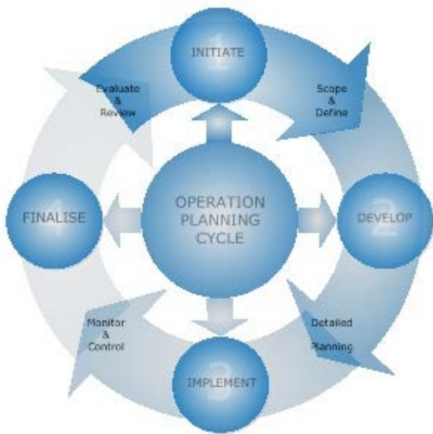
Figure 1 – Operational planning cycle